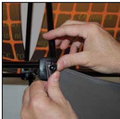
7. Replace o-ring over node. Replace o-ring on remaining 3 hub nodes.