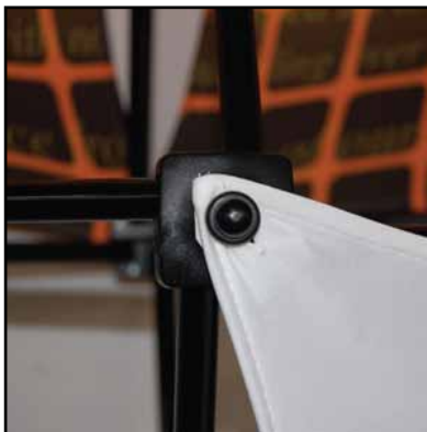
2. Remove the o-ring on each hub node. Retain o-ring for replacement.