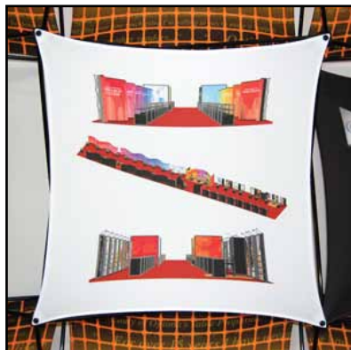
1. Remove the existing skin.