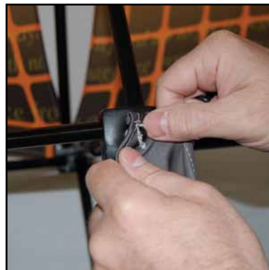
6. Start at the top left or right hub and push button hole in skin corner over the hub node. Attach the remaining 3 corners the same way.