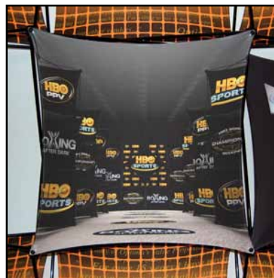
9. Replacement of other skins shapes, i.e., 1x3 or skin styles, i.e., double twists, uses the same concept. Change your skins, or remove to wash if dirty, once you've done it once it's simple. For complex skin configurations retain original photo or take a photo to help map replacement.