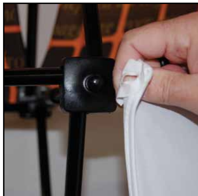
4. Remove the skin from hub by gently pulling corner off of the hub node. Repeat steps 2 thru 4 on the remaining three corners. Fold skin and store.