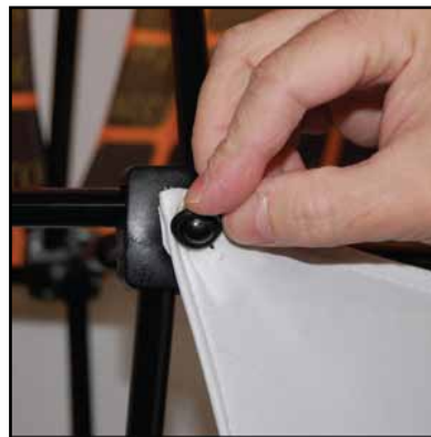
3. The o-ring can be removed with your fingers, if difficult a round end of a paper clip can help pry it off. Take care not to rip the fabric of the graphic.